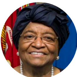
Ellen Johnson Sirleaf Global Board Co-chair, Emerging Public Leaders