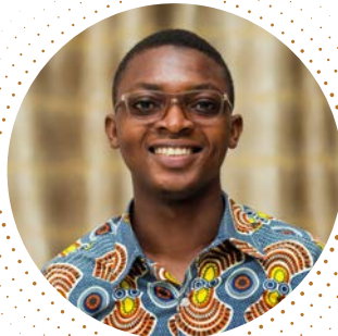
Hocket Apersil Ministry of Agriculture