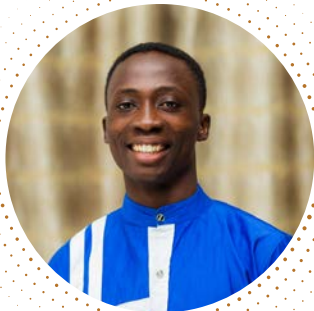
Bright Buernor Kpalam Ministry of Education