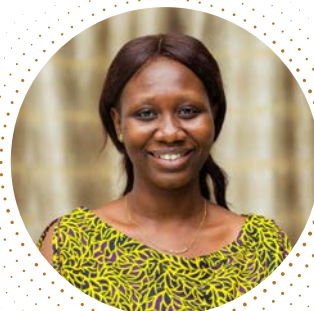
Love Ntumy Ministry of Education